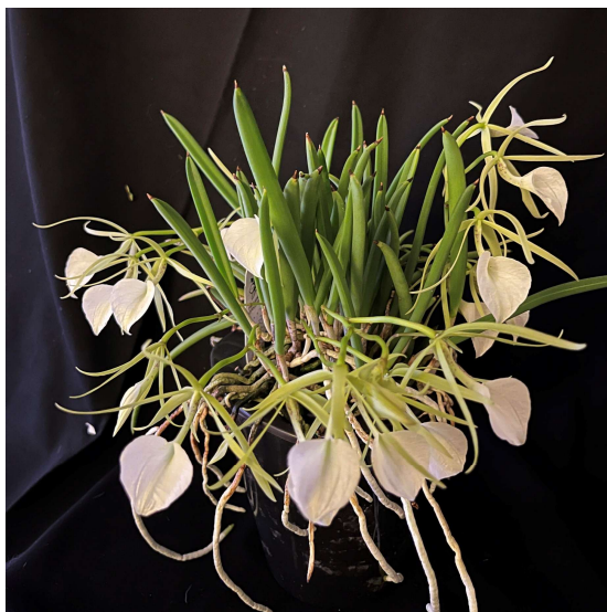
B. Nadosa 'Minnie Mouse'

Notice: Bergen Water Gardens in New Jersey to hold a Lotus Festival July 25-27. Lotus and orchids on display.