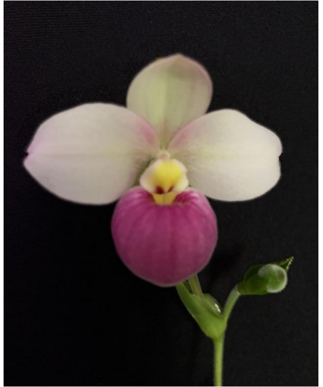
Phragmipedium Pink Panther ( Phrag. schlimii x fischeri )