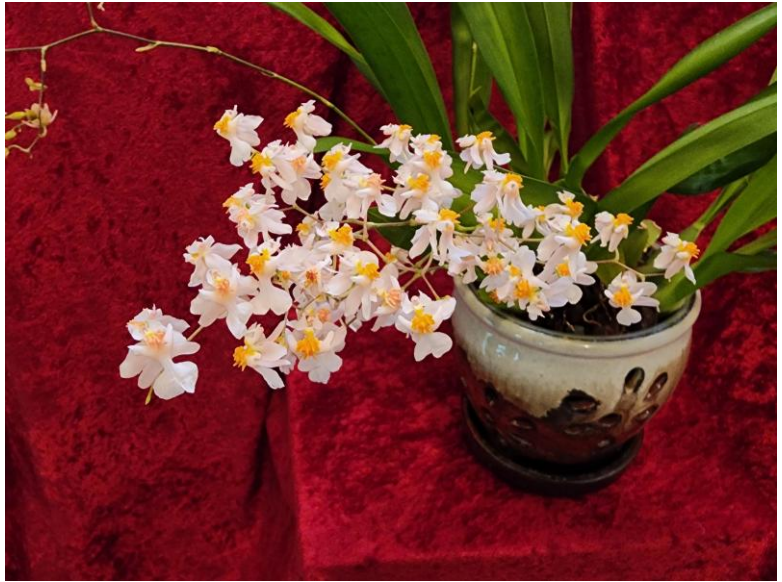
Oncidium (Onc.) Tsiku Marguerite from the STOS Spring auction. It has 7 spikes.