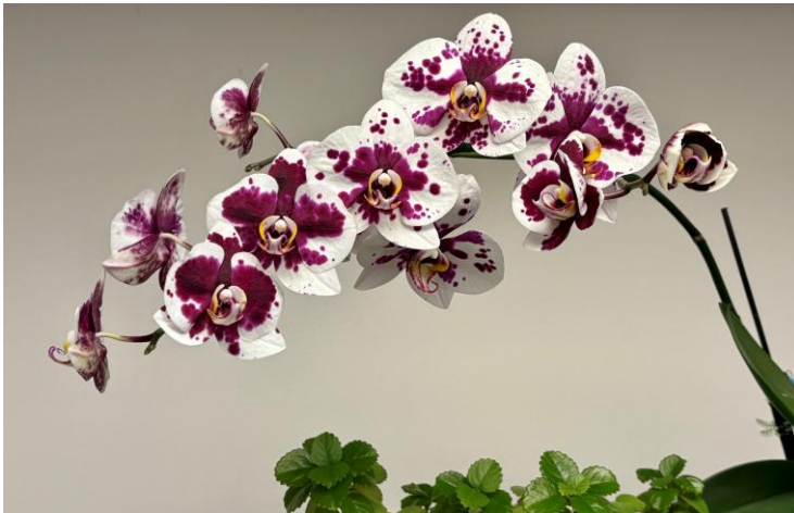
Phalaenopsis No ID purchased 3 years ago from Trader Joe's