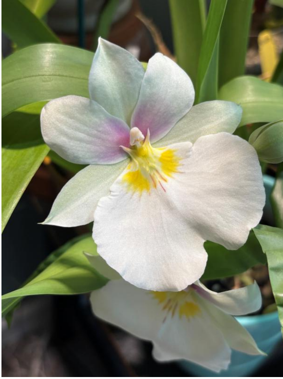
Miltoniopsis Rene Komodo 'Pacific Clouds' second bloom, moderately fragrant, smells like sweet roses