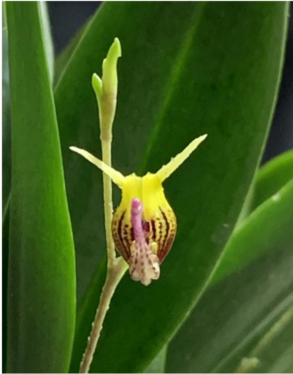
Scaphosepalum breve (Epidendreae subtribe Pleurothallidinae -AOS)