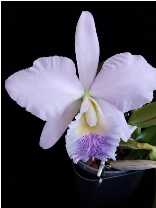
Cattleya Mini Purple Coerulea 4N x C. mossiae f. coerulea 4N