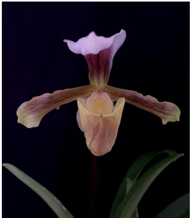
Paphiopedilum barbigerum f. lockianum