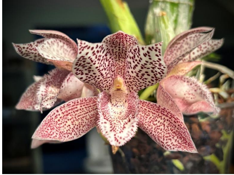
Clowesetum JEM's Speckled Russ (primary hybrid between Clowesia russelliana x Catasetum denticulatum ), mildly fragrant, nice scent