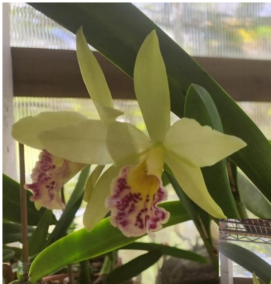
No id ( Cattleya -type) – Laurel Shaefer