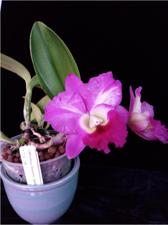
Cattleya Sacramento Splash