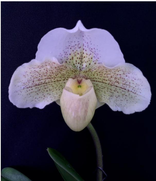
Paphiopedilum Dottie McDowell 'Hampshire' AM/AOS