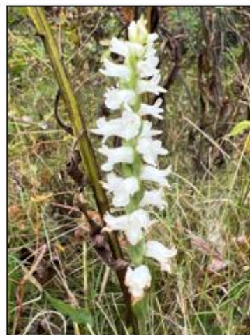
Alan Weakly (iNaturalist), "Spiranthes cernua," no rights reserved CC0

NY Range: Throughout NY in open meadows Flowering: August–September (3–5 weeks) Habitat Notes: Fields, roadsides, moist meadows Pollination Ecology: Small bees attracted