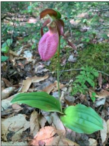
Julia MacCabe, "Cypripedium acaule," Licensed under CC BY-NC 4.0