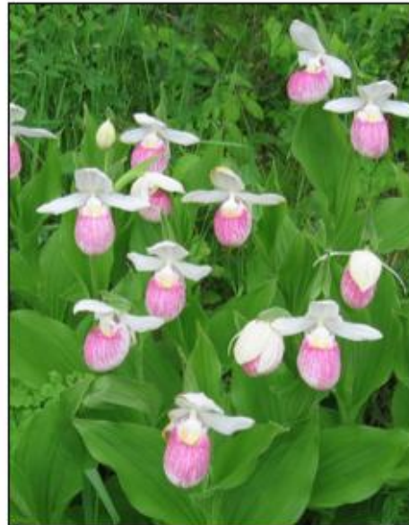
Tom Gulya (iNaturalist), "Cypripedium reginae," no rights reserved CC0

NY Range: Widespread in NY; Adirondacks, Catskills, Long Island pine barrens Flowering: May–June (2–3 weeks) Habitat Notes: Acidic pine and mixed hardwood forests Pollination Ecology: Large bees; bees enter pouch and exit past stigma and anthers