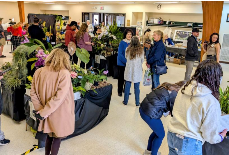
Show visitors and members