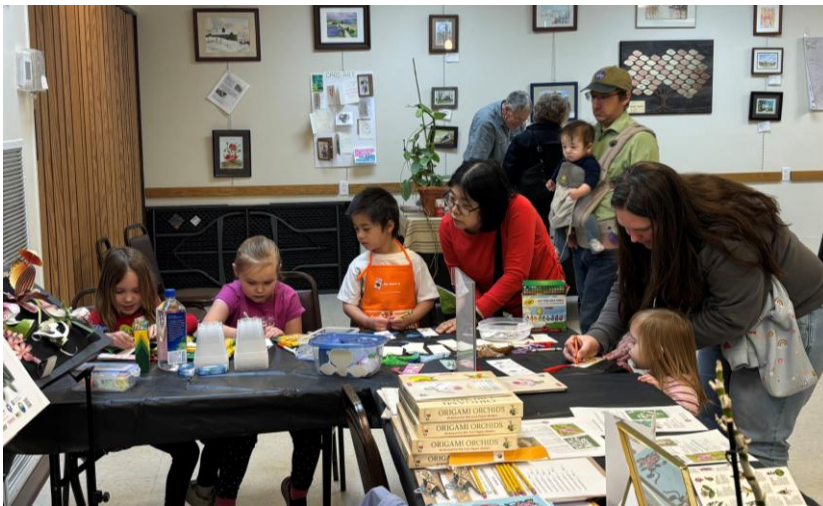
Fun at the Children's Table