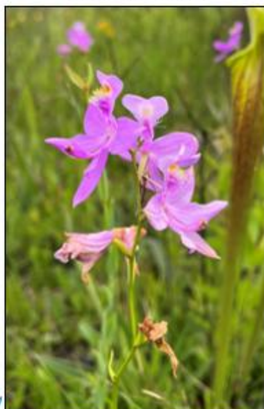
Michael D. Warriner (iNaturalist), "Calopogon tuberosus," no rights reserved CC0

NY Range: Eastern & Central NY wetlands Flowering: June–July (4 weeks) Habitat Notes: Bogs, wet prairies, marsh edges Pollination Ecology: Bees; deceptive lip tips bee onto pollinia