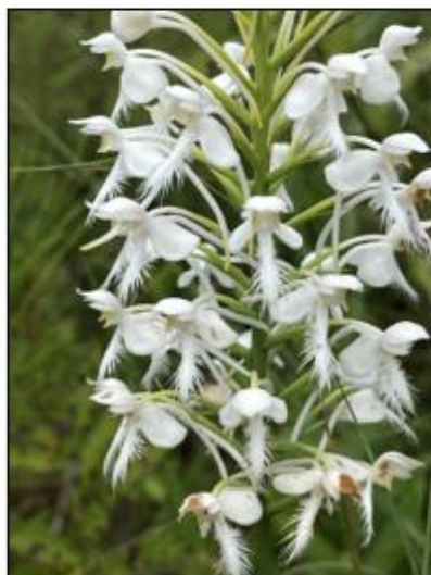
Smokeybear33 (iNaturalist), "Platanthera blephariglottis," no rights reserved CC0