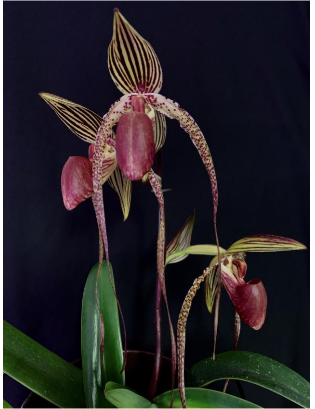
Phrag Prince Edward o York