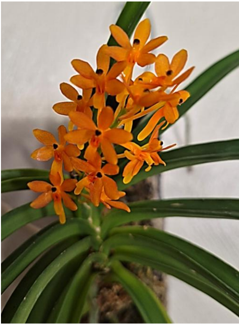
Ascocentrum is 14 years old – Gail Gunsalus