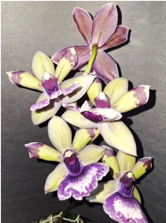
Zygonisia Snow Bird - Laila