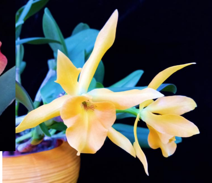
Brassocattleya (Bc.) Daffodil