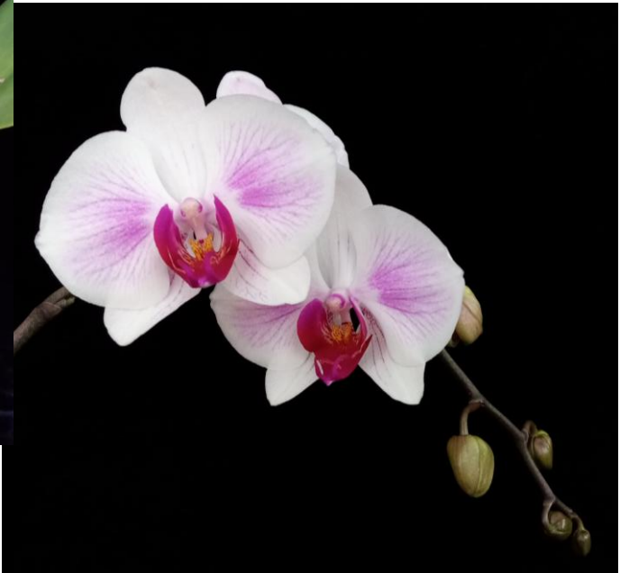
Phal. Miki Cotton Candy