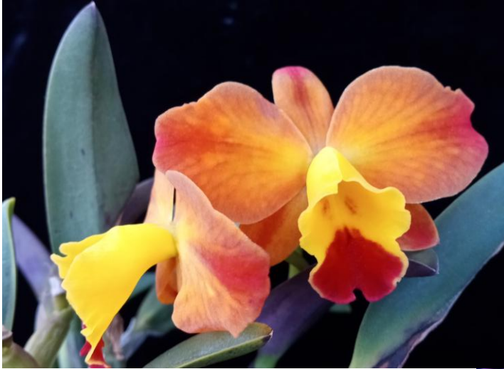
Sophrolaeliocattleya (Slc.) Bella del Caribe