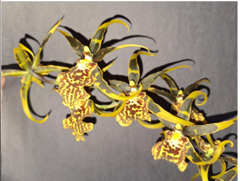
Bracidostele Gilded Tower 'Mystic Maze' - Laila