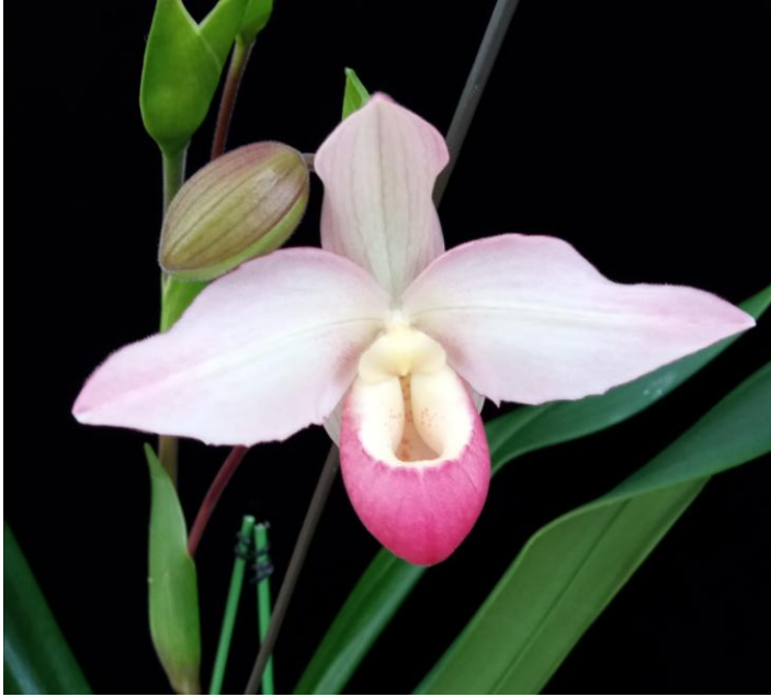
Phrag Cape Sunset