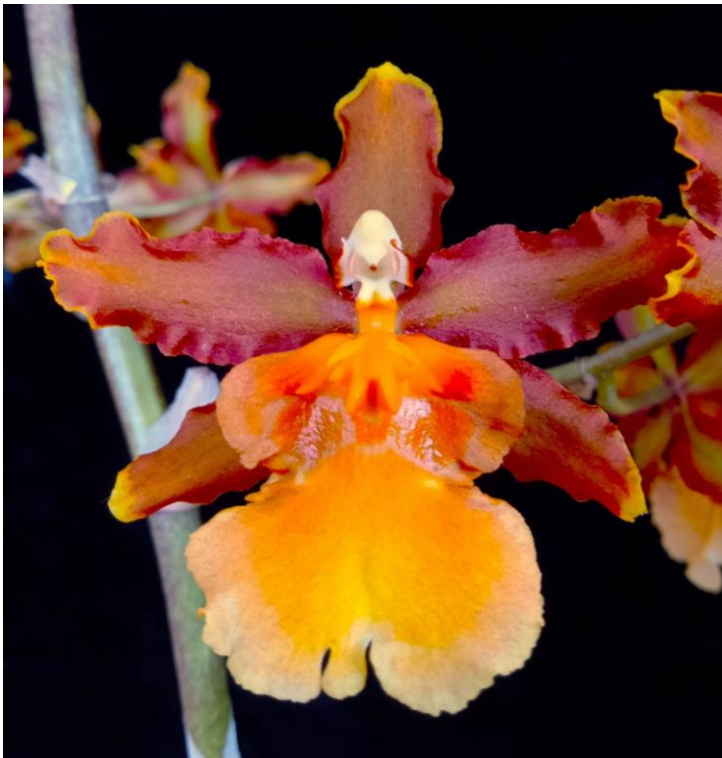
Oncostele Hilo Firecracker 'Lucky Strike'

Divisions of this plant were sold at a STOS auction some time back. You may have one. We didn't know the name at the time and called it an Oncidium.