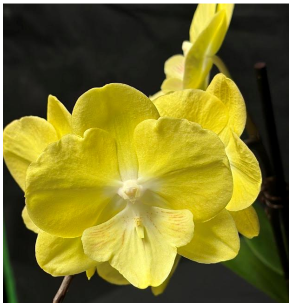
Phal. NOID. Yellow.