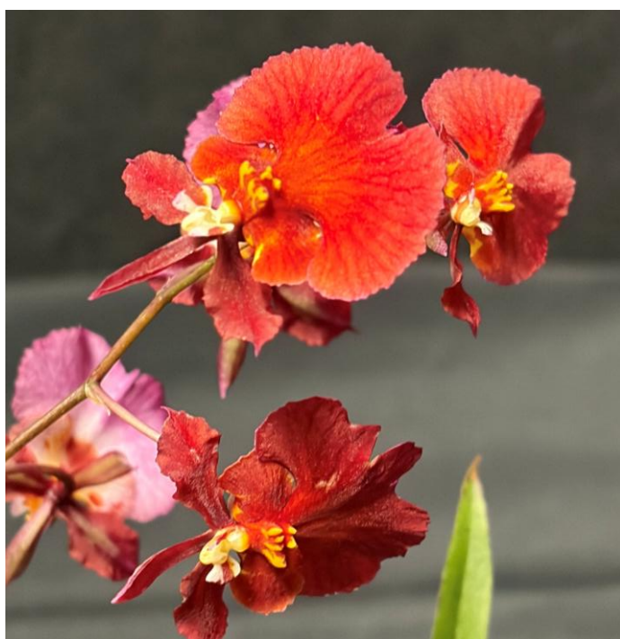
Tolumnia Jairak Firm Red