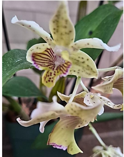
Dendrobium Chocolate chip from Bingo session - Gail Gunsalus