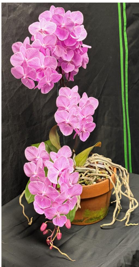
Phal Miki Pink Planet