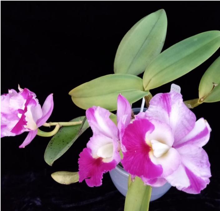
Cattleytonia (Ctna.) Sacramento Splash