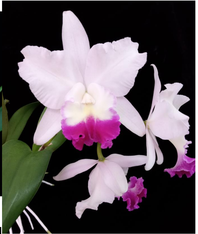
Dialaeliocattleya (Dialc.) Silver Heart x Lc Johanna Rose