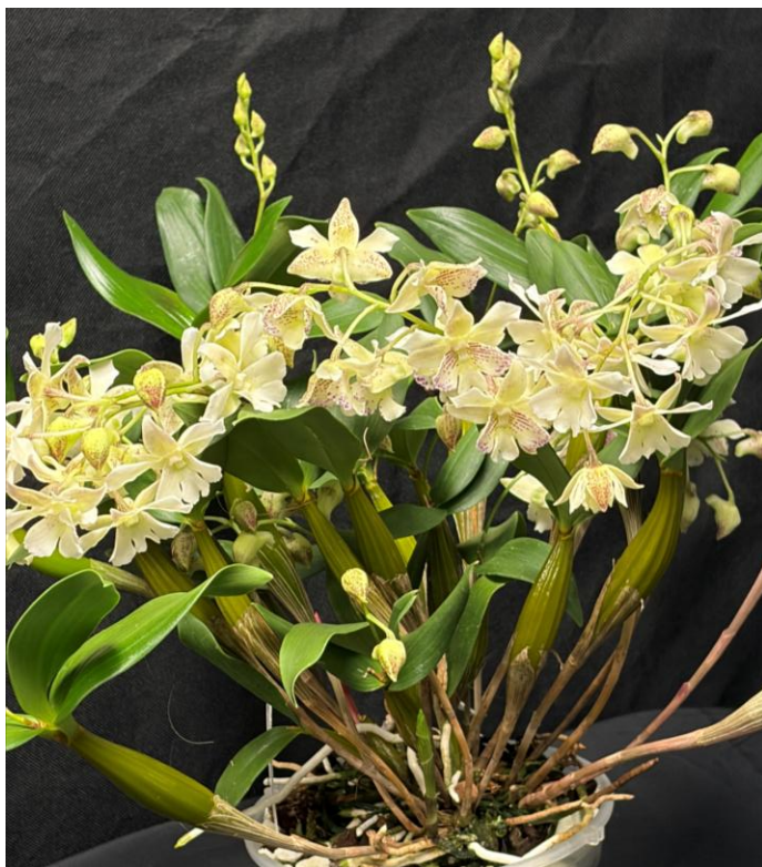
Dendrobium Winter Pixie