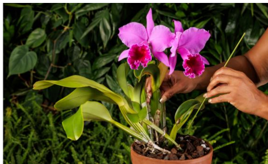
Rhyncholaeliocattleya Memoria Grant Eichler 'Lenette'

The 30th annual orchid exhibition—presented in partnership with the U.S. Botanic Garden (USBG)—is now open at the National Museum of African American History and Culture (NMAAHC). Featuring hundreds of orchids from both collections, the exhibition examines the cultural, historical, and artistic connections inspired by the Orchidaceae family. Visitors can explore stories of prominent African American orchid collectors, view orchid-inspired artworks, and participate in daily orchid discovery activities. Timed entry passes are required and may be reserved through NMAAHC's website. Same day passes are available at the entrance. See NMAAHC staff for assistance