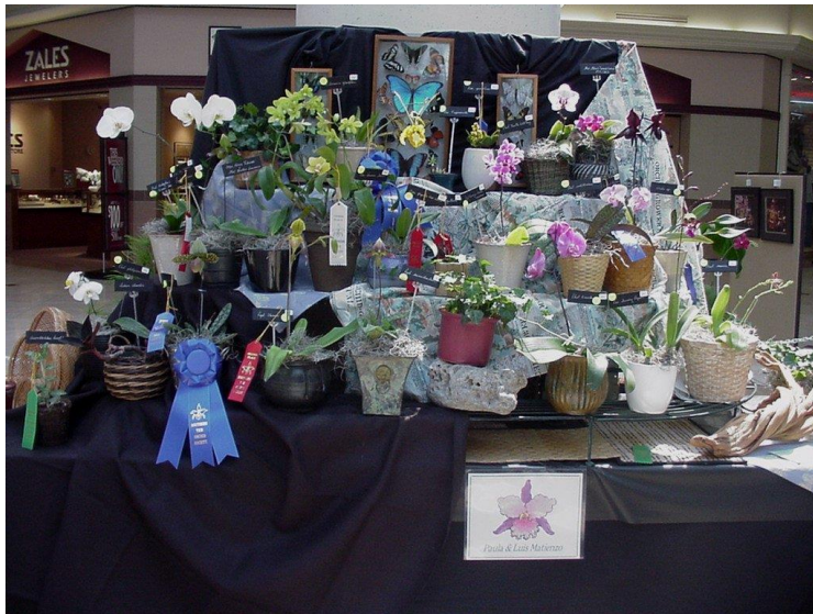
Luis and Paula Matienzo (STOS show 2005)

Or have your own exhibit with very few plants